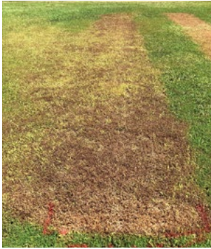
Surmise SpeedPro XT @ 6.4 fl oz/1000 sq ft