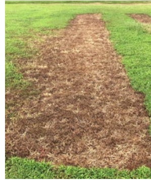
Surmise SpeedPro XT @ 6.4 fl oz/1000 sq ft