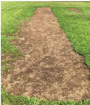
Surmise SpeedPro XT @ 6.4 fl oz/1000 sq ft