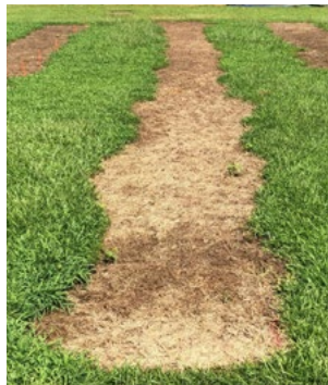
RM43 @ 7.4 fl oz/1000 sq ft