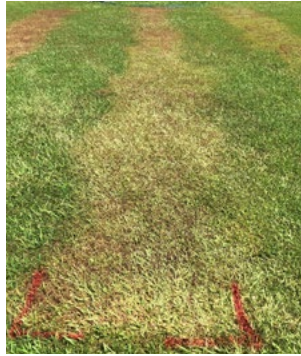
RM43 @ 7.4 fl oz/1000 sq ft