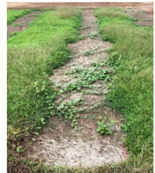
RM43 @ 7.4 fl oz/1000 sq ft