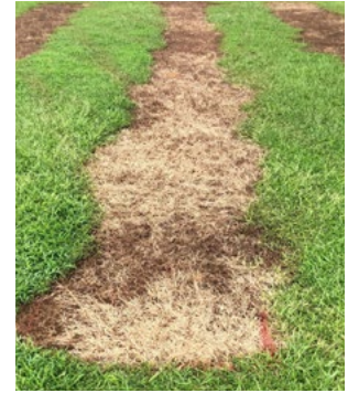
RM43 @ 7.4 fl oz/1000 sq ft